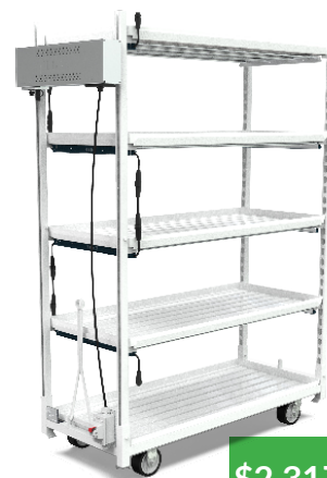
GROW CART 4 SHELF LED