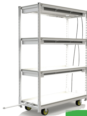
GROW CART 3 SHELF T5